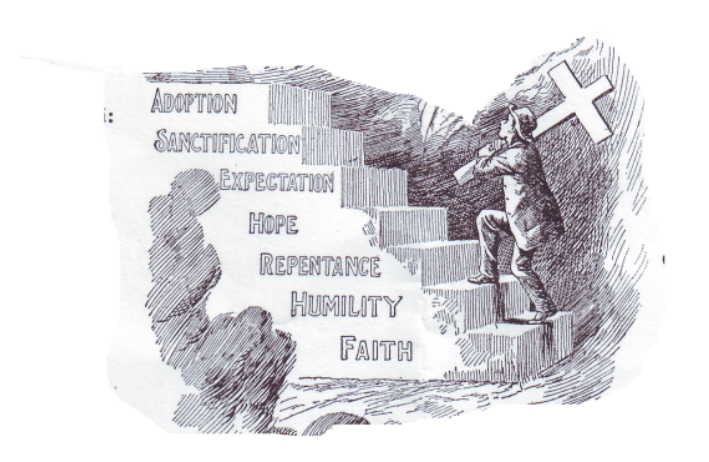
Psalms 16:11 Thou wilt shew me the path of life: in thy presence is fulness of joy; at thy right hand there are pleasures for evermore. Psalms 84:7 They go from strength to strength, ........ Proverbs 4:18 But the path of the just is as the shining light, that shineth more and more unto the perfect day.

"Seven upward steps in Christian life we see, First Faith sincere, and then Humility Then the Repentance shown to God and man, Hope that eager grasps salvation's plan; Then Expectation of the joys to come Promised the Christian in his heavenly home Sanctification, next within the soul, blest Adoption, surety of the whole; While Glory over all sheds luster down, the scripture point him to the starry crown; As hopes like these the Christian's life employ, The Cross seems light, as he presses on with joy."